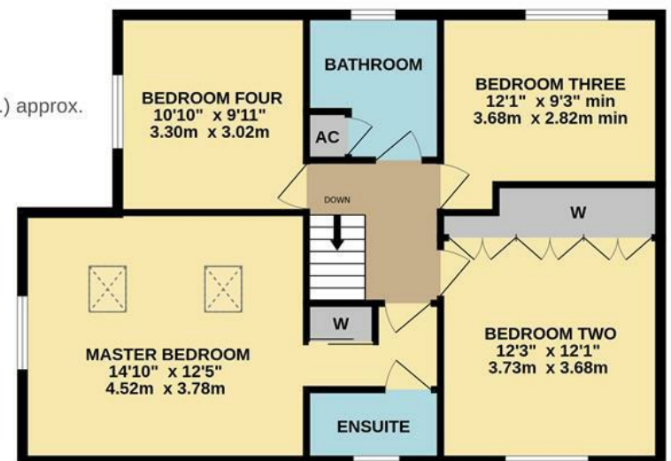
TOTAL FLOOR AREA: 1934 sq.ft. (179.6 sq.m.) approx.

Whilst every attempt has been made to ensure the accuracy of the floorplan contained here, measurements of doors, windows, rooms and any other items are approximate and no responsibility is taken for any error, omission or mis-statement. This plan is for illustrative purposes only and should be used as such by any prospective purchaser. The services, systems and appliances shown have not been tested and no guarantee as to their operability or efficiency can be given. Made with Metropix ©2025